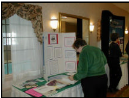
A conference participant explores the OCPA table.