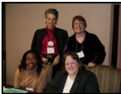
2005 Case Study Judges