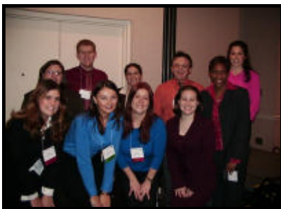
2005 Case Study Participants

Thank you to all of the participants and congratulations to the 1 st , 2 nd and 3 rd place teams.